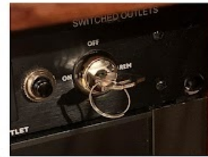
Turn the Key to it's on Position