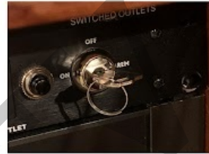
Turn the Key to it's on Position