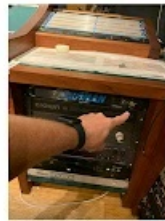
The "Mains Power"