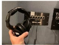
Main Live Room Inputs

Connect up 2 pairs of headphones for your talent by using the 1/4" inserts on the patch panel labeled "Headphones."