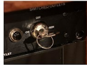
Turn the Key to it's on Position